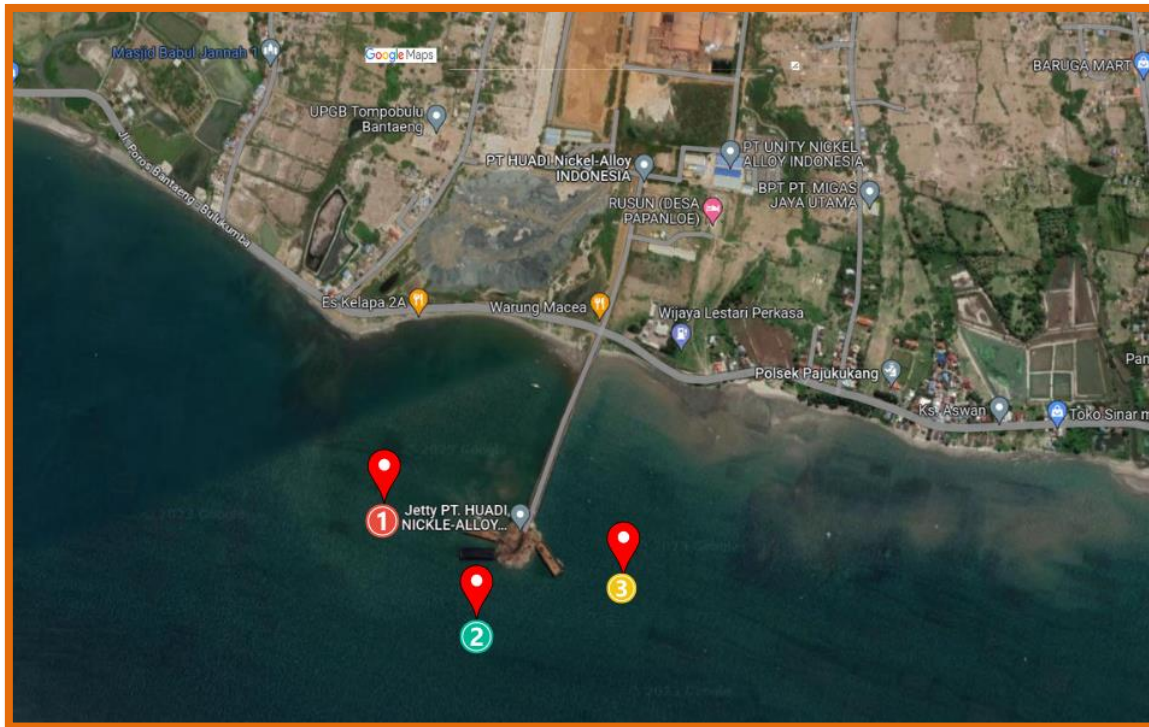
Figure 1. Sampling Point (1) west; S 5°35'10.4064" E 120°03'44.7228" (2) south; S 5°35'18.168" E 120°03'46.1088" (3) east; S 5°35'14.5932" E 120°03'53.8776"

Some samples were observed in situ and ex situ, with testing carried out at Ak-Manufaktur Laboratory and BBIHP Laboratory. The types of physical, chemical, and metal parameters dissolved in seawater tested in this study, as well as the measurement methods and analytical standards used, are presented in Table 1.