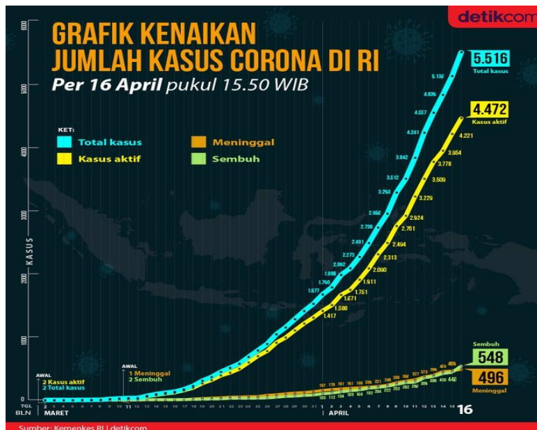
Picture 2. Graph of the Increase in the Number of Corona Cases in Indonesia

Based on data up to 2 March 2020, the mortality rate was 2.3 percent worldwide while it was 4.9 percent in Wuhan City and 3.1 percent in Hubei Province. This figure is 0.16 percent in other provinces in China.8.9 Based on a study of the first 41 patients in Wuhan, 6 people died (5 ICU patients and 1 non-ICU patient).